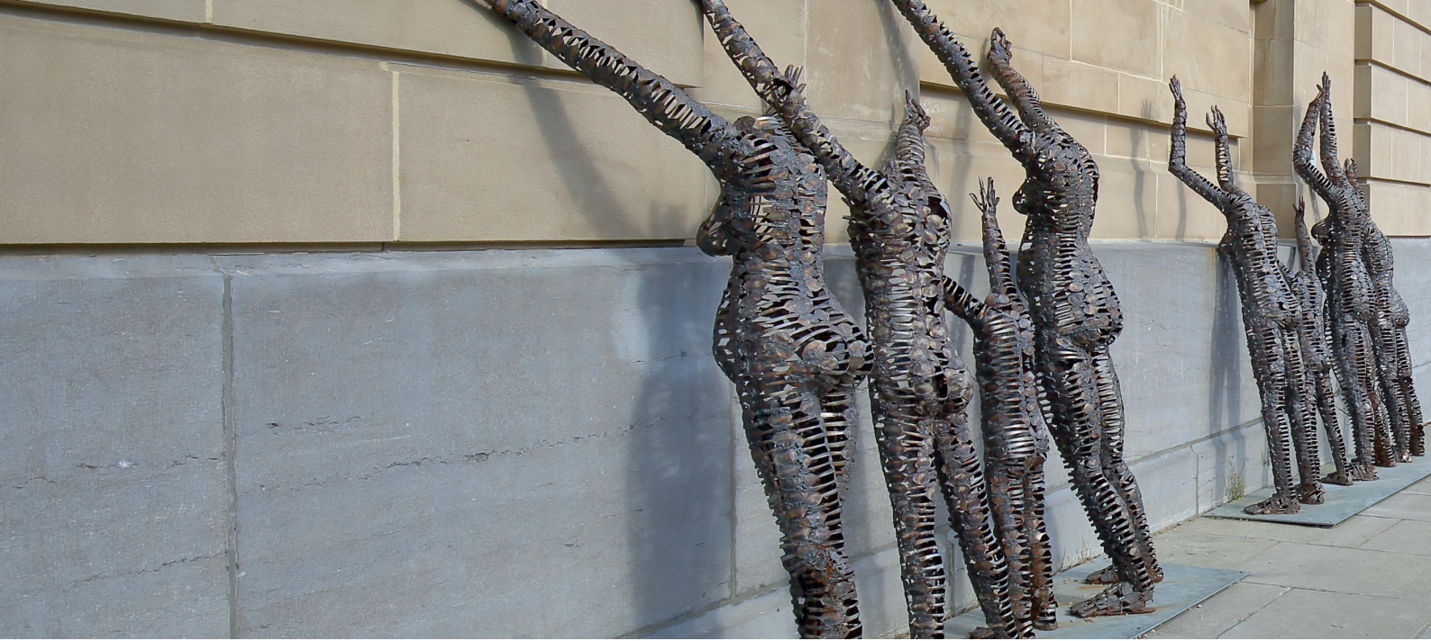
Freddy Tsimba (1967), Centres fermés, rêves ouverts , Tervuren, 2016. Outdoor installation on the museum façade