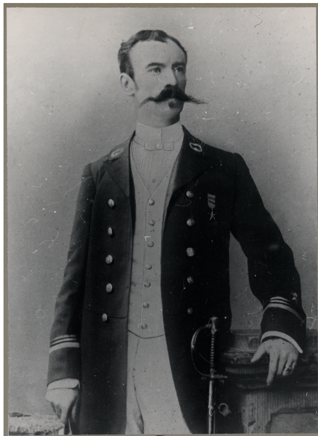
Portrait of Léon Rom

It was almost certainly in the context of Rom's participation in this violent conflict that such a document came into his hands. We do not know if this document was seized by/given to Rom during this violent conflict. Logically, keeping this 'souvenir' of a defeated enemy could confer on him its trophy value. However, unlike many of his peers, Rumaliza, who repeatedly opposed the installation of the German and Belgian armed forces in the Tanganyika region, survived the various attacks and managed to escape, eventually settling in Zanzibar, where he continued his trading activities.